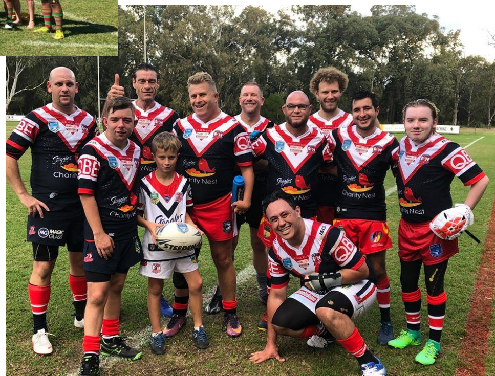
Playing for Roosters