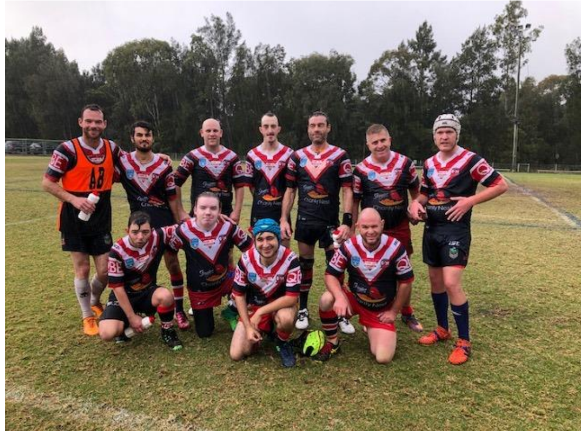
Above: Playing for the Roosters