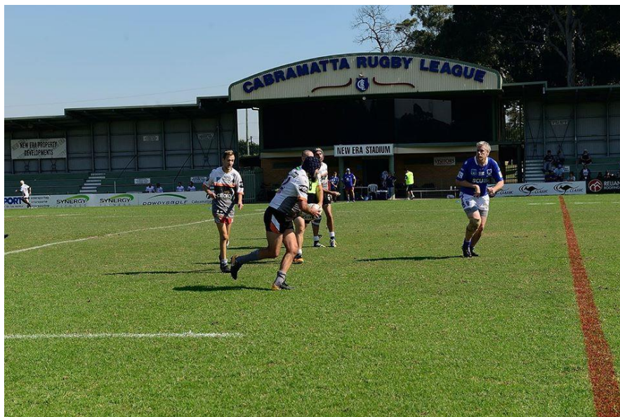
New Era Stadium