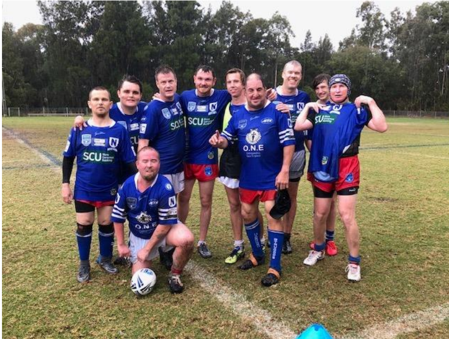
Above: Playing for Newtown