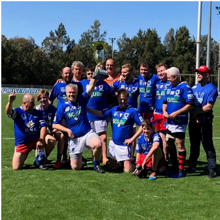
2019 KARI Premiership winners – NSWPDRLA Newtown Jets