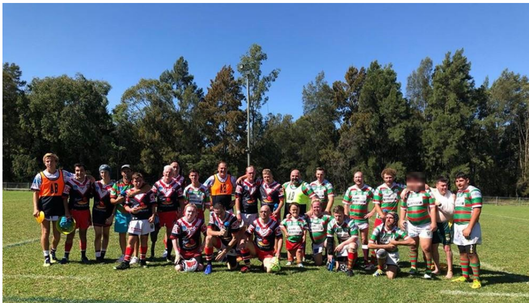
Playing in their registered team – South Sydney