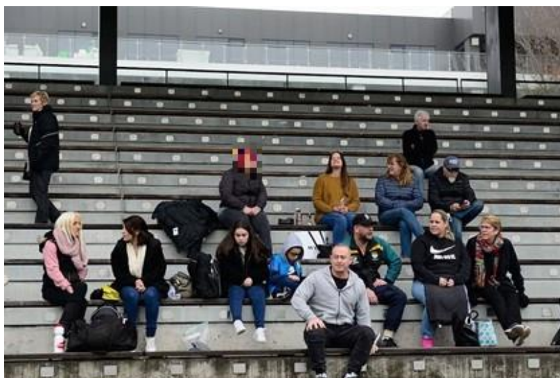
Left PDRLA loyal family, friends and volunteers