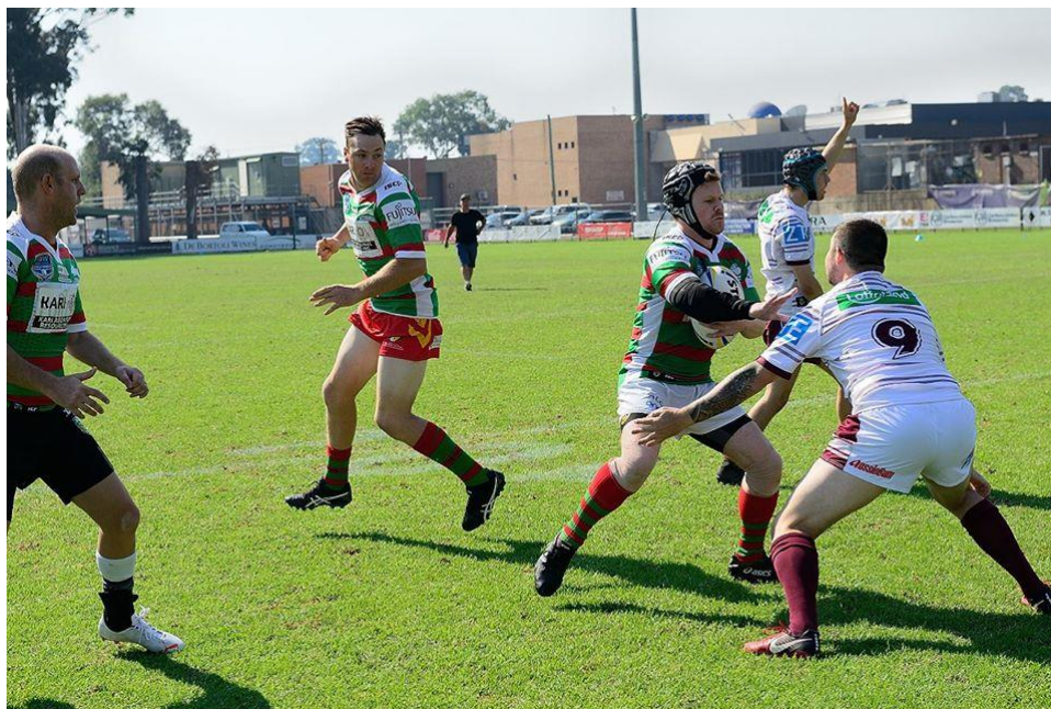
Above Left to Right